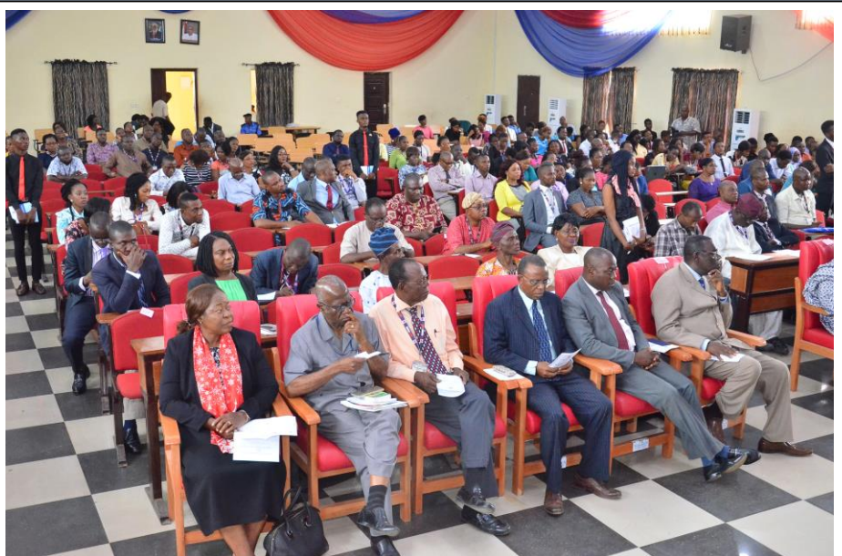
A cross-section of participants at the public lecture on new universities as new opportunities.